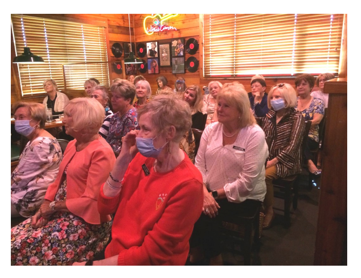
Seating was arranged so everyone could see and hear the speaker and business meeting better. Then they returned to their seats where Texas Roadhouse served their delicious meals.